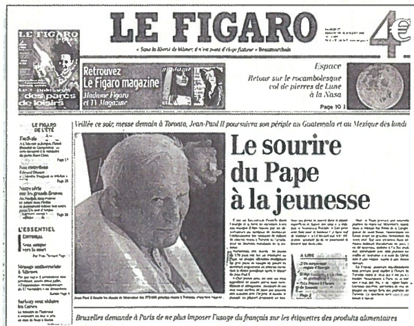
① "LE FIGARO" (France) issued on July 28, 2002 Youthful Smile of the Pope

The French newspaper "LE FIGARO" reported the news of pope's Toronto visit on their front page, saying "What is the new treatment of the Pope?"