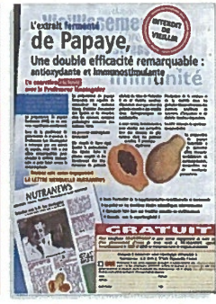
© Marianne (France) issued in September, 2002

"What is the effect of Fermented Papaya Preparation? ...it is immune enhancement, antioxidant, and cell's anti-aging..."