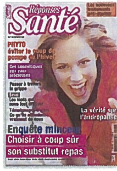
© Reposes Sanè (France) issued in November, 2002