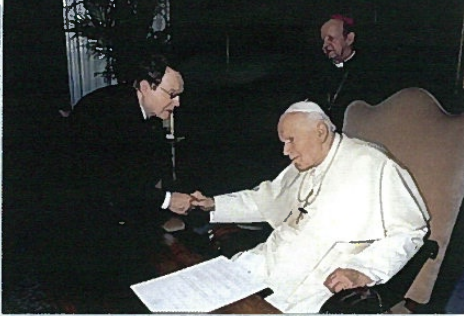
Prof. Montagnier's audience with the Pope in June 23, 2002

In June 2002, Prof. Luc Montagnier (HIV discoverer, President of World Foundation Aids Research and Prevention) handed FPP directly to the Pope at the Vatican and recommended treatment for health recovery. It became top news in Italian newspapers.