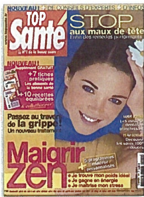
© Top Santé (France) issued in November, 2002

"Because of the antioxidant property, Fermented Papaya Preparation has effects to eliminate free radicals which is a cause of aging and to prevent some diseases like cancers, Parkinson's disease, Alzheimer's disease or Aids."